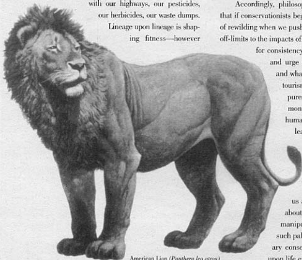
American Lion ( Panthera leo atrox )